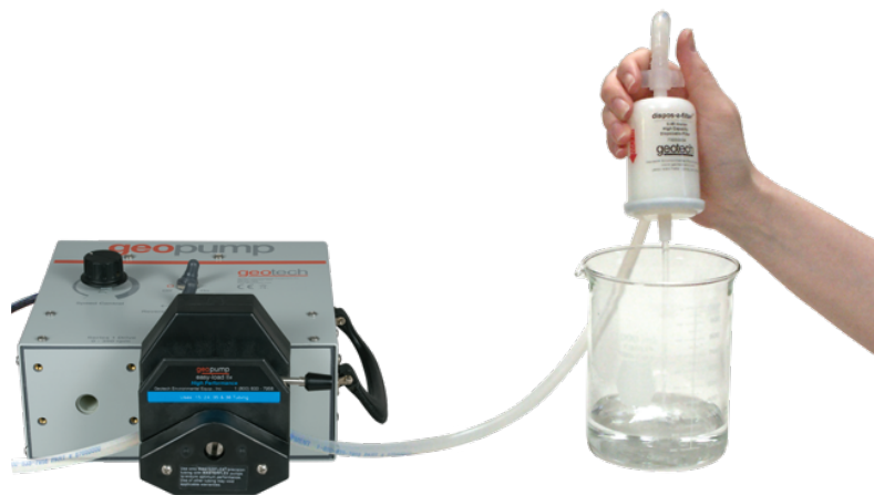
Sample collection with the Geopump™ Peristaltic Pump Series II with optional Easy-load® II pump head (dispos-a-filter™ capsule sold separately)