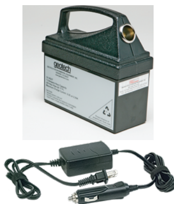
Geopump™ 12V Portable Battery and Charger