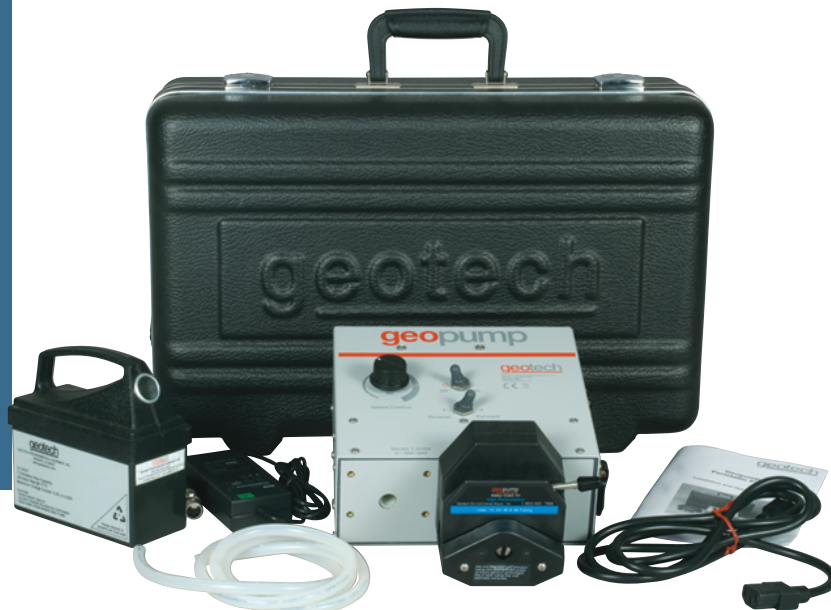
Geopump™ Peristaltic Pump Series II Kit with optional Easy-load® II pump head, modular battery, 5 ft. (1.5 m) tubing, carrying case and power cord

SERIES II Geopump™ Peristaltic Pumps are available in AC only, DC only, or AC/DC combination. They have two pumping stations which can also be piggy-backed for multi-station pumping. The first pumping station has a variable speed of 30 to 300 RPM and the second station 60 to 600 RPM.