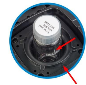
Figure 2-2: Sample chamber

The sample vials must be very clean while calibrating or doing field readings; no debris or fingerprints should be visible on the glass. Use a soft cleaning cloth to ensure clarity before each measurement. Do no store samples and vial in extreme temperatures or direct sunlight.