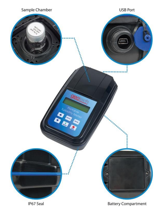
Figure 1-1: Instrument Features