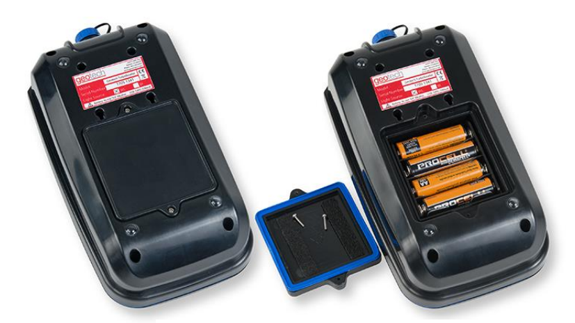
Figure 2-1: Replacing the batteries