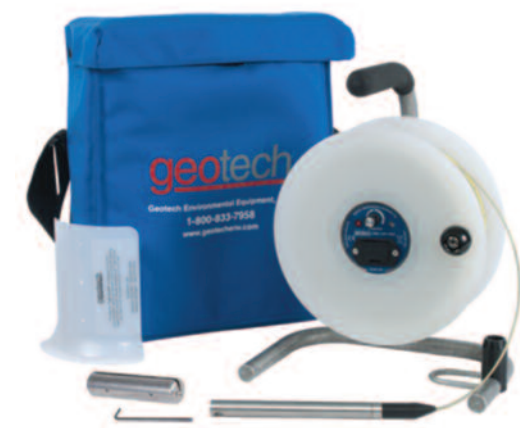
Geotech ET with optional bag and tape weight