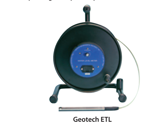
5/8" (1.59cm) Field Replaceable Probe